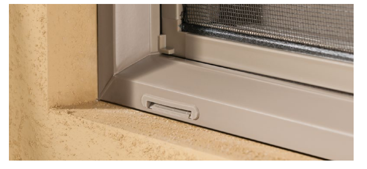
Weep Hole System

Proper maintenance of your weep system is required to assure proper drainage. Periodically inspect the weep holes on the exterior bottom rails to make certain they are clear of any dirt or debris. Use a soft brush to clear openings, if necessary.